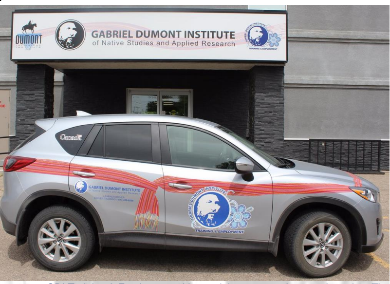
GDI Training & Employment driver training program is up and running. The first cohort in Saskatoon has completed training with five students passing on first attempt at their driver's test. The driver training will also be held in various locations across Saskatchewan.

Repeating a summary of what has been said back to the speaker is a technique used by the listener to restate what has been said in their own words. Summarizing involves taking the main points of the received message and reiterating them in a logical and clear way, giving the speaker chance to correct if necessary.